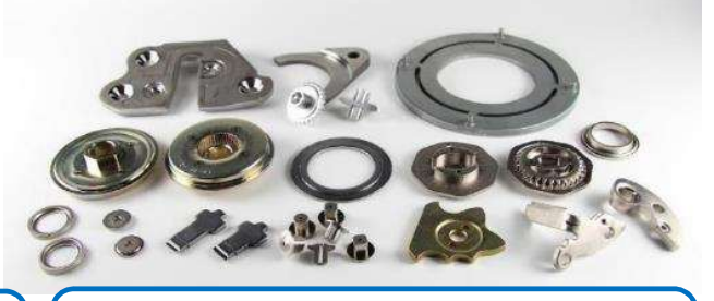
Plate forging technology to form three dimensional shape by increasing or decreasing the material plate thickness