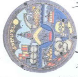
The view from Port Tower